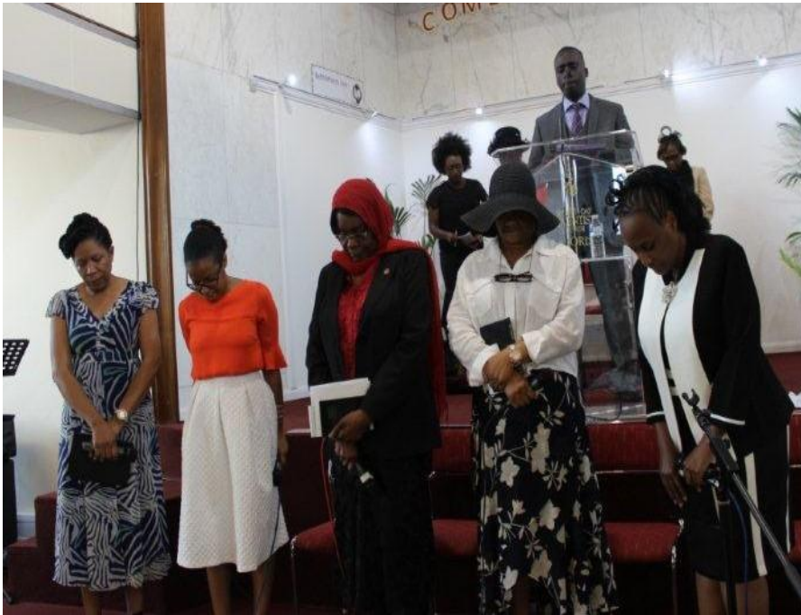
Stand In Awe